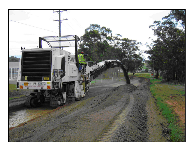
Figure 2 Sidecasting of pavement material using a 2 m wide profiler.