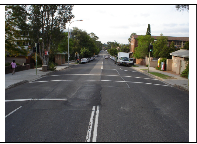
Figure 1 Candidates for crossblending of road materials prior to stabilisation.

Crossblending is an insitu treatment prior to stabilisation to improve the uniformity of the granular materials to be stabilised with an appropriate binder. This process also allows greater recycling within a pavement maintenance program.