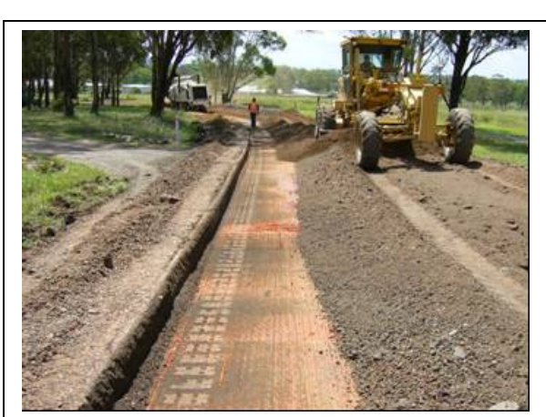
Figure 5 Pushing the blended material back into the boxed pavement area.