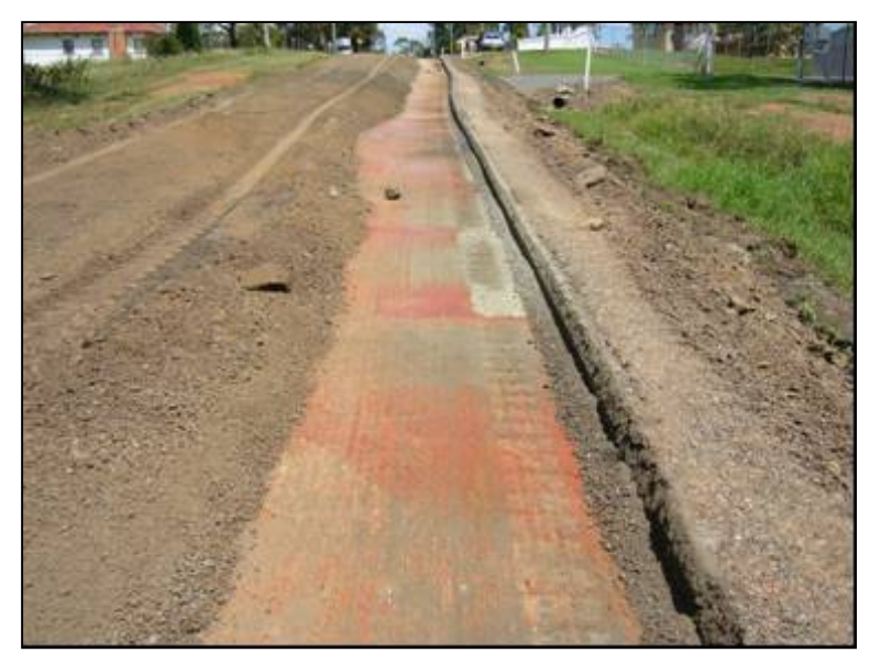
Figure 6 After the removal of the pavement material the subgrade will be exposed allowing the opportunity to repair the subgrade rather than risk pavement distress at a later date.