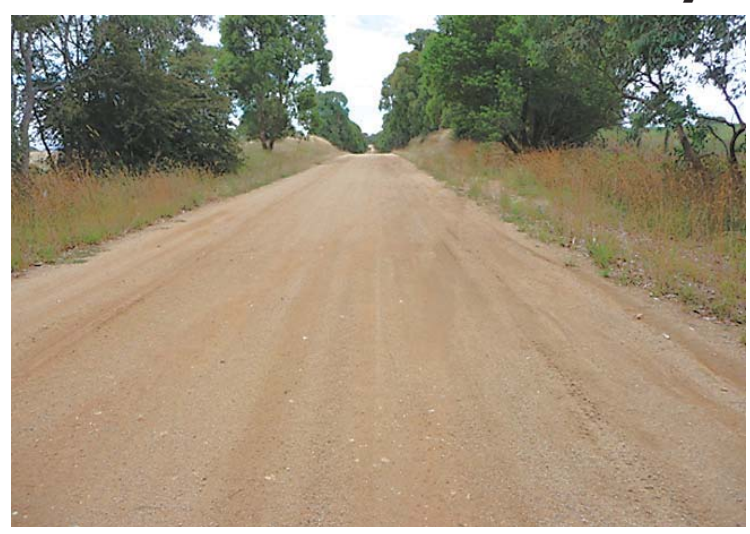
Above: Two year old stabilised pavement which has no maintenance.

More details about the research findings are available on the association website.