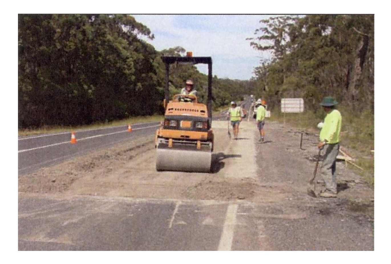
Figure 1: Small Mobile Roller