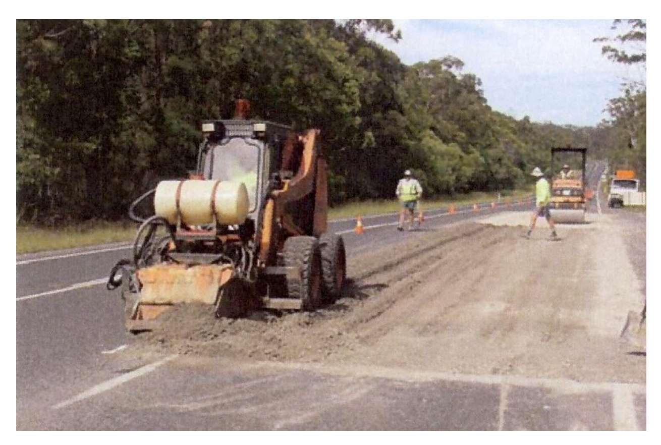
Figure 3: Skidsteer with "Stabilising" Head

24<sup>th</sup> ARRB Conference – Building on 50 years of road and transport research, Melbourne, Australia 2010