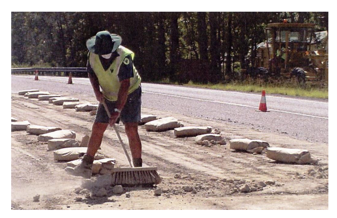
Figure 2: Bag Spreading for Stabilised Patches