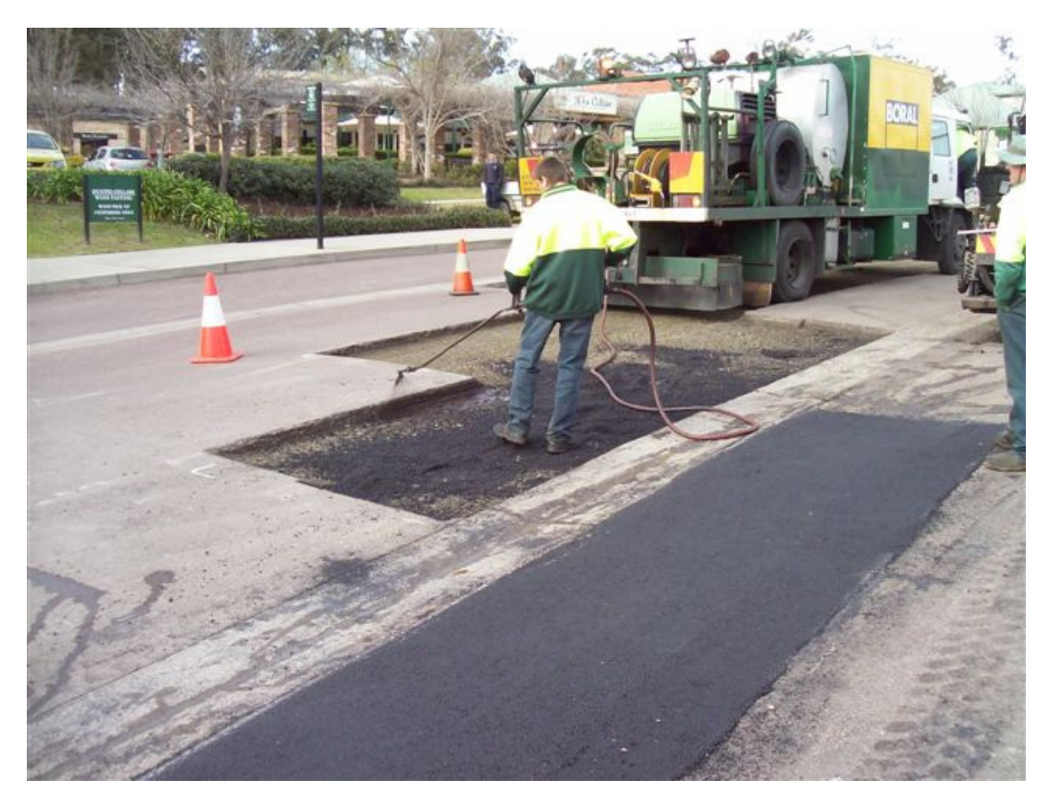
Figure 4: Asphalt Patches