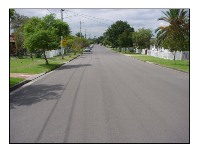
Figure 3 A local road that has been recycled again in the Fairfield City Council (NSW) region showing great performance for the last 10 years.

Many local road authorities in Sydney and Brisbane and have started to recycle again existing cement stabilised pavements that have come to the end of their life with the same treatment due to low costs and rapid construction. Figure 3 shows a typical candidate that had been insitu stabilised with GP cement in the 1970s and was recycled again in 1997 using a triple blend of GP cement, slag and fly ash.