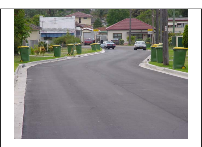
Figure 1 Insitu stabilisation is a simple process of mixing the existing pavement material with a binder (left) and then compacting and resurfacing the road.